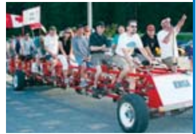
KWSA raised $3,000+ in pledges for Heart & Stroke Foundation.