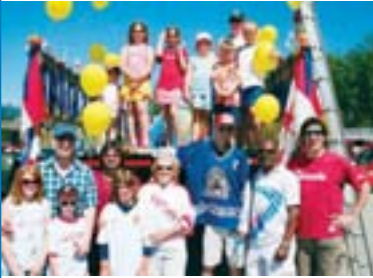
Kids, mom's and dad's decorated the float for the Canada Day parade.