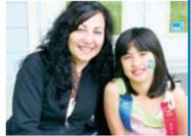
Painted, smiling, happy faces during the picnic.