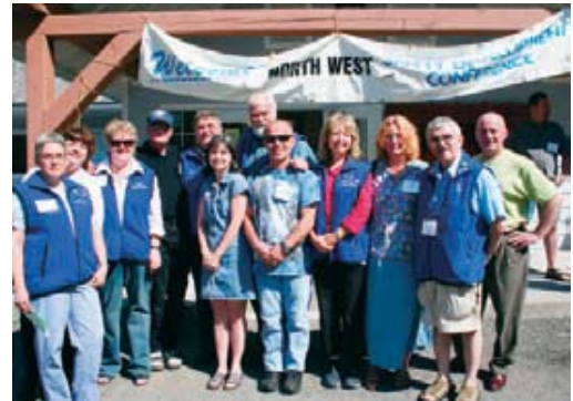
▲ CSSE organizers and volunteers pose for the ingot camera.