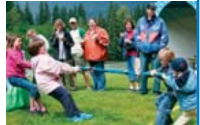
Kids tug it out during the tug-of-war challenge.