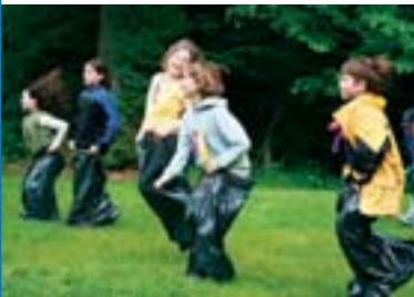
The kids loved the sack races at the picnic.